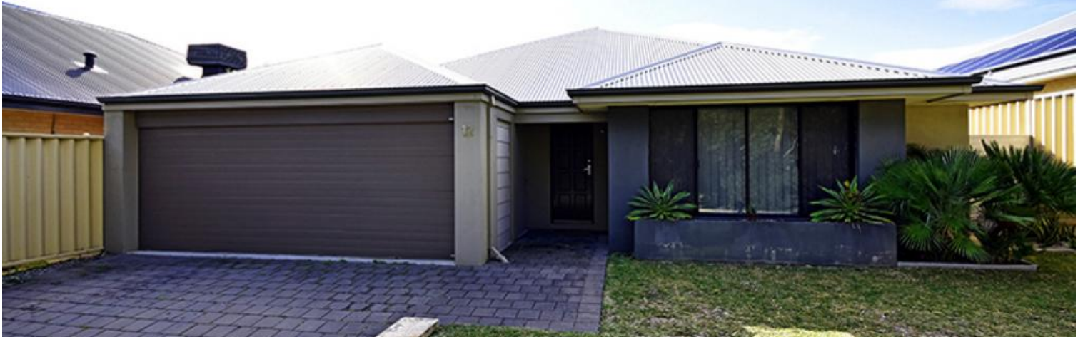
12 Eastwall Pkwy, Butler