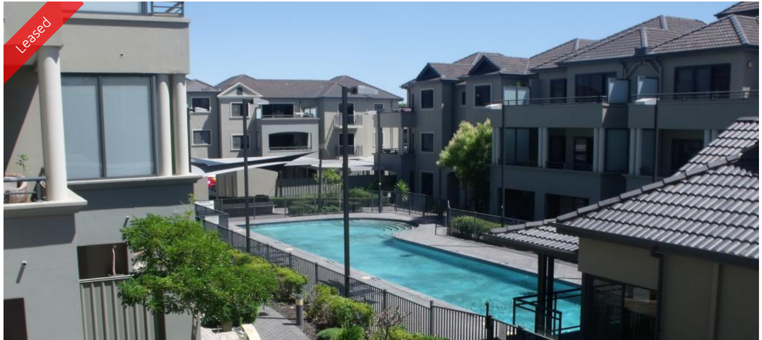
Unit 62, 12 Citadel Way, Currambine