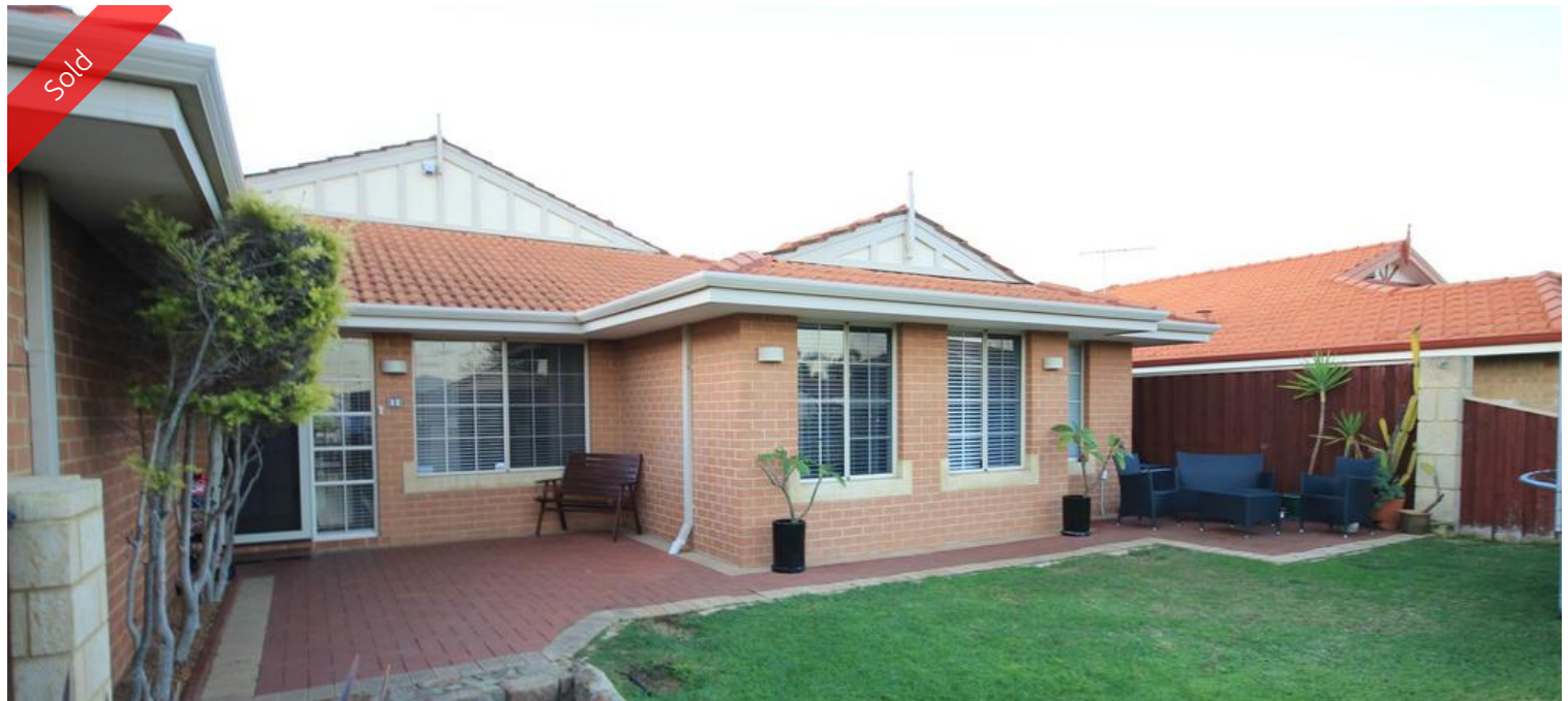
9 Milford Green, Mindarie